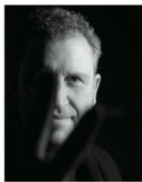
Ergonomic Design by HISAKO NOMURA