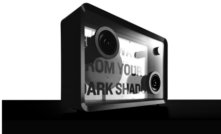
*Original model of COTODAMA Lyric Speaker

<About COTODAMA Lyric Speaker> COTODAMA Lyric Speaker is the next generation of speakers which displays lyrics in sync with the music developed by COTODAMA Inc. When you choose a song on your mobile phone, the lyrics show up on the translucent screen. Music analysis technologies developed by National Institute of Advanced Industrial Science and Technology (AIST) automatically analyze the song's mood and structure, and the built-in expression engine creates motion graphics to each song that's played.