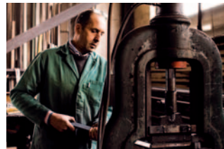
Custom Metalwork Atelier

“That which is believed to be unusual, is my everyday”