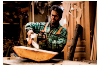
Wood carver and sculptor

“The blade penetrates firmly and influences the grain of the wood, bringing its essential forms to the light”