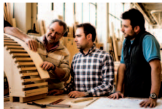
Designers of wooden furnishings

“Architecture is a matter of art; the décor is there to move you”