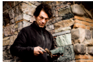
Artist and sculptor

“An artist who loves to share beauty and rejoice in it, expressing it with passion through each work”