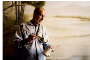
Artist, decorator and renovator

“For over 20 years, we have decorated and restored spaces using traditional techniques of mural-painting”