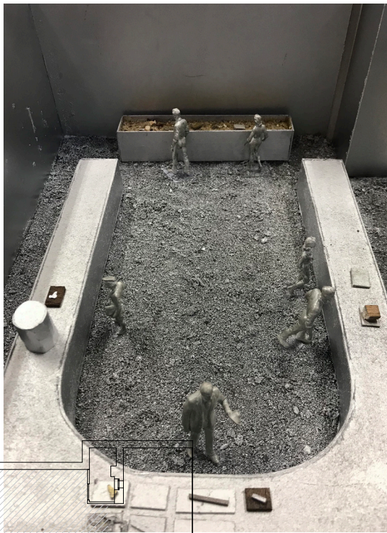
Demonstration and Process of Sand Cast Molding