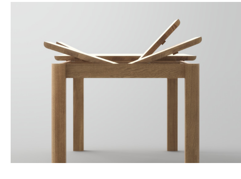
Table VIVUS now fits perfectly into any room. Another advantage of this smart giant is the possibility of its complete disassembly for transport purposes – thanks to this a generous dining and conference table can also be transported through narrow staircases.

With all these changes the table legs always remain at the outer edges and consequently they do not change anything of the timeless forms of this pull-out table. Spacious legroom is ensured in every position.