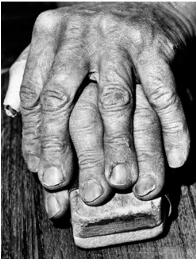
The hands of a PP Møbler artisan showing marks of more than 60 years of experience in working with crafted solid wood furniture'