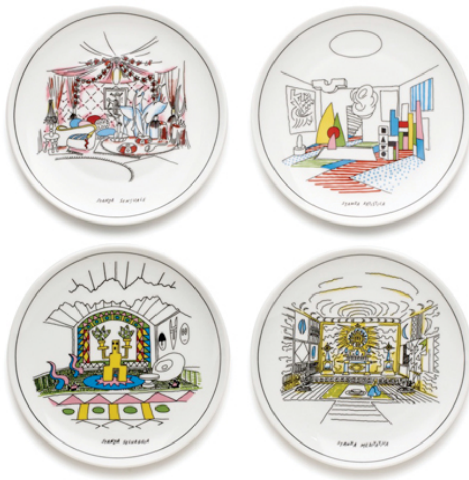
Mendini Plate by Alessandro Mendini for De Gustibus Collection (Design Memorabilia)

These are the protagonists that will be providing exceptional and unusual suggestions for contemporary living, thanks to the commitment and passion of the companies leading the industry, with their attention to sensitive and sustainable design that is able to improve and give value to our daily lives.