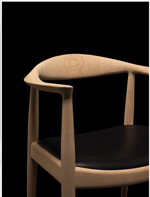
Soap treated oak pp503 Round Chair design 1950 by Hans J. Wegner