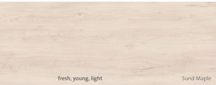
fresh, young, light

Travel with us from the castles of the Loire to the fresh breezes of the Norwegian fjords. Experience the energy of the wuthering Niagara falls and enjoy a Vino Rosso on the patio of the Lago Maggiore. Listen to the sound of the city, while sipping your Caipirinha and enjoy a trip on a paddle steamer through the lazily flowing waves of the Mississippi. Look forward to a guided tour to the most beautiful water experience on this planet. Trend themes describe the living desires of current and future consumers. Independent collections with a clear statement visualize the living environment. Creative colour and structure combinations inspire exiting design ideas. Stimulating images and collection names open up a new perspective. Let your imagination run wild and dive into our H 2 O concept.